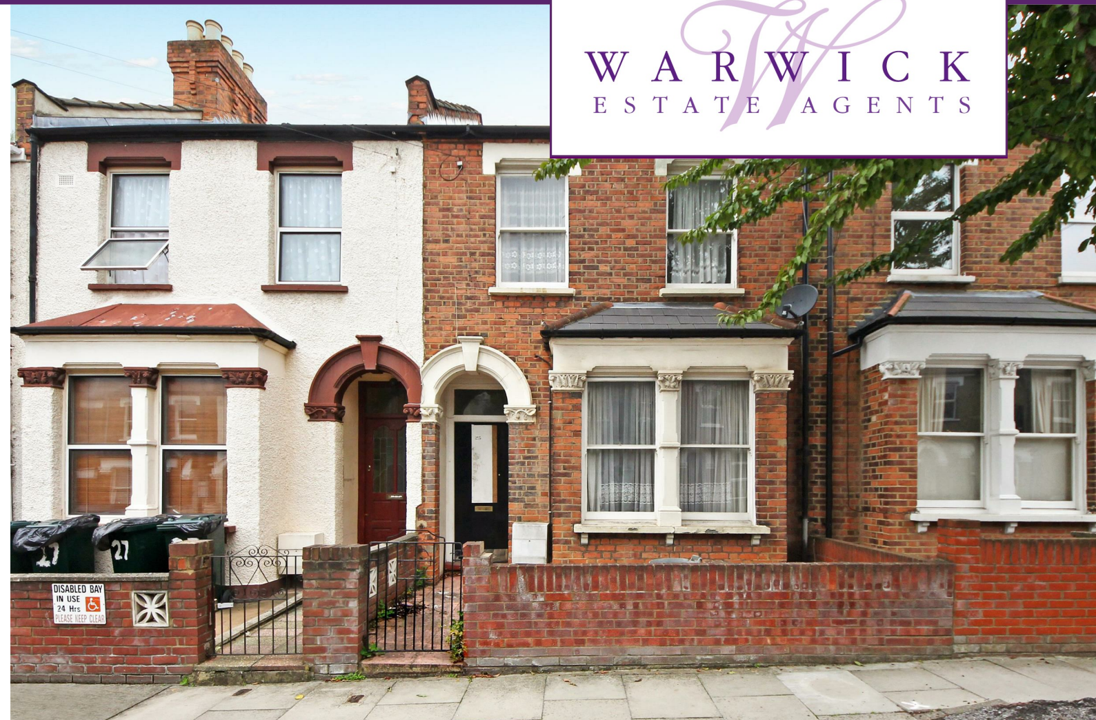
Holberton Gardens, College Park, NW10 6AY